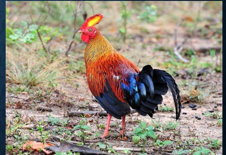
Our National Animal is Junglefowl