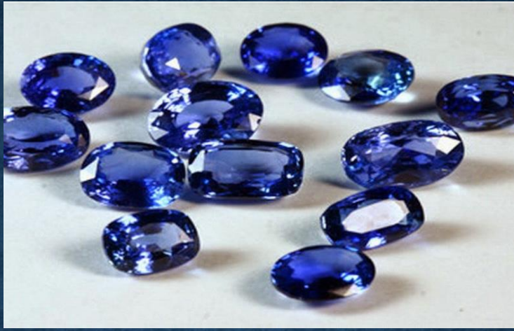
National Gem is Blue Sapphire