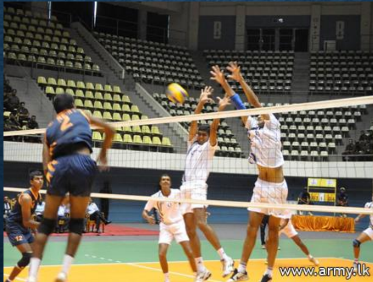
Our National Sport is Volley Ball