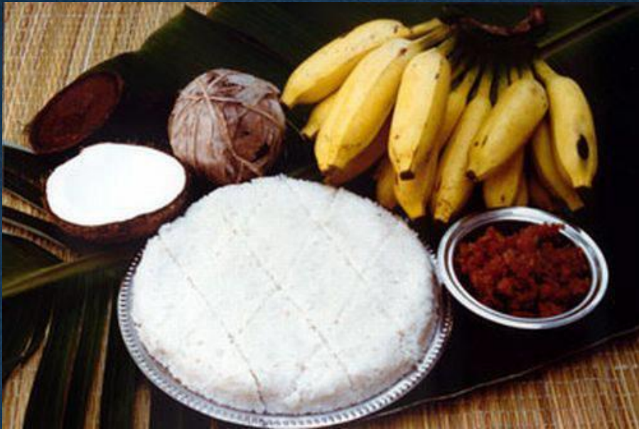
Milk Rice - Kiribath