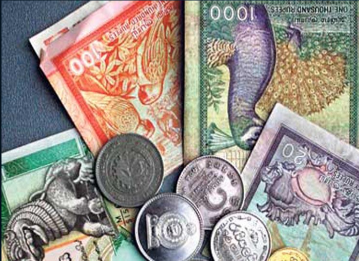
Sri Lankan Rupees