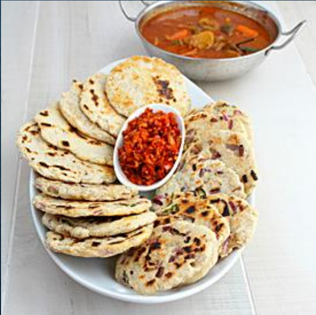
Coconut rotti and Onion Sambol