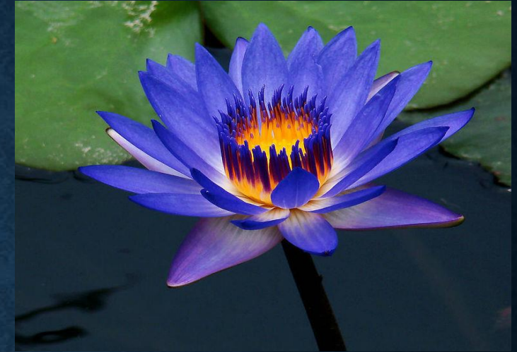
National Flower is Water Lily