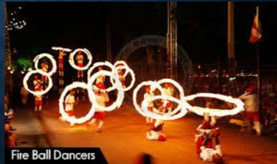
Fire Ball Dancers